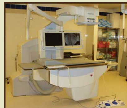
The new urology table is installed in a special room off the main operating area.

too great to wait to fundraise for the entire amount for the table prior to adding this valuable equipment to the hospital. The new table was installed in late September and cost $500,000.